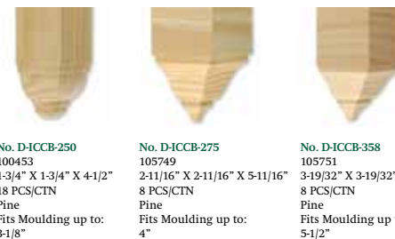
No. D-ICCB-250 100453 1-3/4" X 1-3/4" X 4-1/2" 18 PCS/CTN Pine Fits Moulding up to: 3-1/8" No. D-ICCB-275 105749 2-11/16" X 2-11/16" X 5-11/16" 8 PCS/CTN Pine Fits Moulding up to: 4" No. D-ICCB-358 105751 3-19/32" X 3-19/32" X 7-1/2" 8 PCS/CTN Pine Fits Moulding up to: 5-1/2"