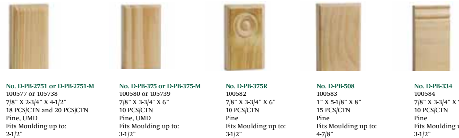
No. D-PB-2751 or D-PB-2751-M 100577 or 105738 7/8" X 2-3/4" X 4-1/2" 18 PCS/CTN and 20 PCS/CTN Pine, UMD Fits Moulding up to: 2-1/2" No. D-PB-375 or D-PB-375-M 100580 or 105739 7/8" X 3-3/4" X 6" 10 PCS/CTN Pine, UMD Fits Moulding up to: 3-1/2" No. D-PB-375R 100582 7/8" X 3-3/4" X 6" 10 PCS/CTN Pine Fits Moulding up to: 3-1/2" No. D-PB-508 100583 1" X 5-1/8" X 8" 15 PCS/CTN Pine Fits Moulding up to: 4-7/8" No. D-PB-334 100584 7/8" X 3-3/4" X 7" 10 PCS/CTN Pine Fits Moulding up to: 3-1/2"