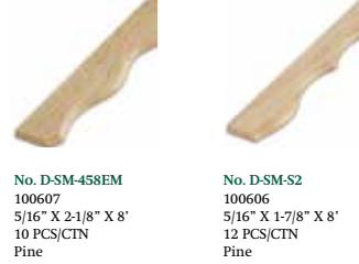
No. D-SM-458EM 100607 5/16" X 2-1/8" X 8" 10 PCS/CTN Pine No. D-SM-S2 100606 5/16" X 1-7/8" X 8" 12 PCS/CTN Pine