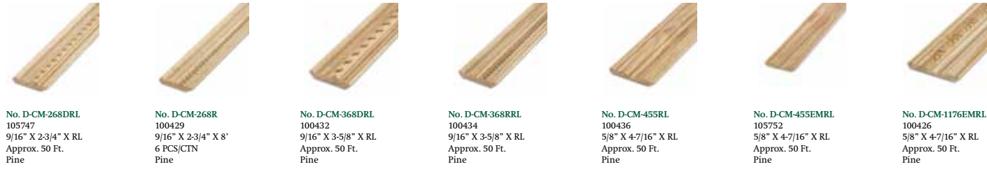
No. D-CM-268DRL 105747 9/16" X 2-3/4" X RL Approx. 50 Ft. Pine No. D-CM-268R 100429 9/16" X 2-3/4" X 8" 6 PCS/CTN Pine No. D-CM-368DRL 100432 9/16" X 3-5/8" X RL Approx. 50 Ft. Pine No. D-CM-368RRL 100434 9/16" X 3-5/8" X RL Approx. 50 Ft. Pine No. D-CM-455RL 100436 5/8" X 4-7/16" X RL Approx. 50 Ft. Pine No. D-CM-455EMRL 105752 5/8" X 4-7/16" X RL Approx. 50 Ft. Pine No. D-CM-1176EMRL 100426 5/8" X 4-7/16" X RL Approx. 50 Ft. Pine