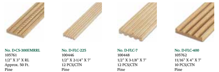
No. D-CS-300EMRRL 105761 1/2" X 3" X RL Approx. 50 Ft. Pine No. D-FLC-225 100446 1/2" X 2-1/4" X 7" 12 PCS/CTN Pine No. D-FLC-7 100448 1/2" X 3-1/8" X 7" 10 PCS/CTN Pine No. D-FLC-400 105762 11/16" X 4" X 7" 10 PCS/CTN Pine