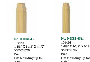
No. D-ICBB-458 100455 1-1/8" X 1-1/8" X 4-1/2" 35 PCS/CTN Pine Fits Moulding up to: 3-1/4" No. D-ICBB-6518 100456 1-1/8" X 1-1/8" X 6-1/2" 35 PCS/CTN Pine Fits Moulding up to: 5-1/4"