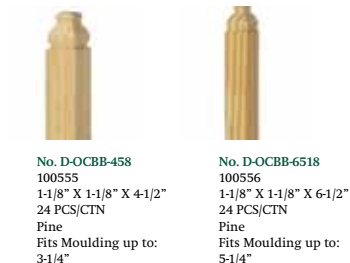
No. D-OCBB-458 100555 1-1/8" X 1-1/8" X 4-1/2" 24 PCS/CTN Pine Fits Moulding up to: 3-1/4" No. D-OCBB-6518 100556 1-1/8" X 1-1/8" X 6-1/2" 24 PCS/CTN Pine Fits Moulding up to: 5-1/4"