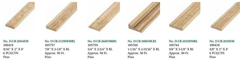
No. D-CR-2054EM 100419 9/16" X 2" X 8" 6 PCS/CTN Pine No. D-CR-21290EMRL 105757 7/8" X 2-1/8" X RL Approx. 50 Ft. Pine No. D-CR-268EMRRL 105759 3/4" X 2-3/4" X RL Approx. 50 Ft. Pine No. D-CR-300EMRL 105760 1-1/16" X 2-15/16" X RL Approx. 50 Ft. Pine No. D-CR-2010EMRL 105744 5/8" X 3-1/8" X RL Approx. 50 Ft. Pine No. D-CR-2010EM 100438 5/8" X 3" X 8" 6 PCS/CTN Pine