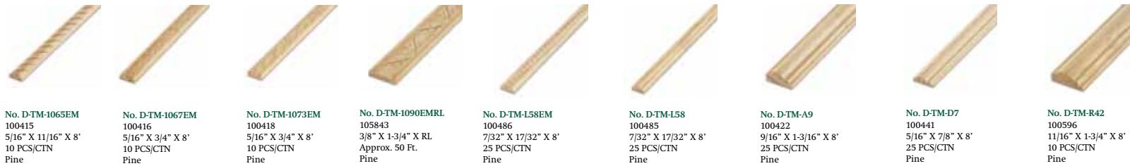
No. D-TM-1065EM 100415 5/16" X 11/16" X 8" 10 PCS/CTN Pine No. D-TM-1067EM 100416 5/16" X 3/4" X 8" 10 PCS/CTN Pine No. D-TM-1073EM 100418 5/16" X 3/4" X 8" 10 PCS/CTN Pine No. D-TM-1090EMRL 105843 3/8" X 1-3/4" X RL Approx. 50 Ft. Pine No. D-TM-L58EM 100486 7/32" X 17/32" X 8" 25 PCS/CTN Pine No. D-TM-L58 100485 7/32" X 17/32" X 8" 25 PCS/CTN Pine No. D-TM-A9 100422 9/16" X 1-3/16" X 8" 25 PCS/CTN Pine No. D-TM-D7 100441 5/16" X 7/8" X 8" 25 PCS/CTN Pine No. D-TM-R42 100596 11/16" X 1-3/4" X 8" 10 PCS/CTN Pine No. D-ROPE4 100600 3/8" X 3/4" X 8" 12 PCS/CTN Pine