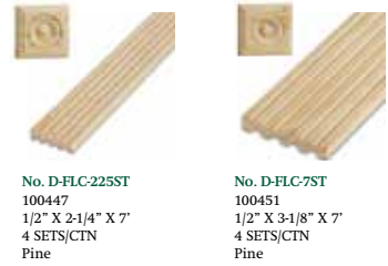
No. D-FLC-225ST 100447 1/2" X 2-1/4" X 7" 4 SETS/CTN Pine No. D-FLC-7ST 100451 1/2" X 3-1/8" X 7" 4 SETS/CTN Pine