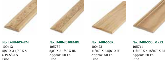
No. D-BB-1054EM 100412 5/8" X 3-1/8" X 8" 6 PCS/CTN Pine No. D-BB-2010EMRL 105737 5/8" X 3-1/8" X RL Approx. 50 Ft. Pine No. D-BB-650RL 100423 11/16" X 6-5/8" X RL Approx. 50 Ft. Pine No. D-BB-550EMRRL 105741 11/16" X 4-15/16" X RL Approx. 50 Ft. Pine