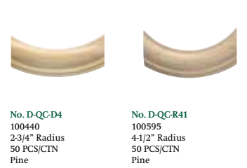
No. D-QC-D4 100440 2-3/4" Radius 50 PCS/CTN Pine No. D-QC-R41 100595 4-1/2" Radius 50 PCS/CTN Pine