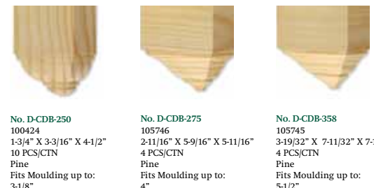
No. D-CDB-250 100424 1-3/4" X 3-3/16" X 4-1/2" 10 PCS/CTN Pine Fits Moulding up to: 3-1/8" No. D-CDB-275 105746 2-11/16" X 5-9/16" X 5-11/16" 4 PCS/CTN Pine Fits Moulding up to: 4" No. D-CDB-358 105745 3-19/32" X 7-11/32" X 7-1/2" 4 PCS/CTN Pine Fits Moulding up to: 5-1/2"