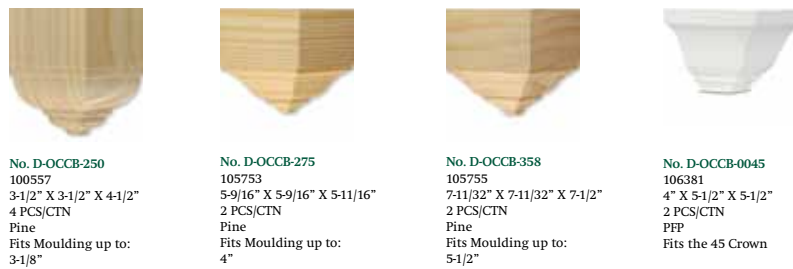
No. D-OCCB-250 100557 3-1/2" X 3-1/2" X 4-1/2" 4 PCS/CTN Pine Fits Moulding up to: 3-1/8" No. D-OCCB-275 100553 5-9/16" X 5-9/16" X 5-11/16" 2 PCS/CTN Pine Fits Moulding up to: 4" No. D-OCCB-358 105755 7-11/32" X 7-11/32" X 7-1/2" 2 PCS/CTN Pine Fits Moulding up to: 5-1/2" No. D-OCCB-0045 106381 4" X 5-1/2" X 5-1/2" 2 PCS/CTN PPF Fits the 45 Crown