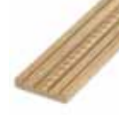
No. D-CS-300EMRRL 105761 1/2" X 3" X 8" Approx. 50 Ft. Pine