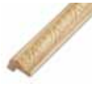
No. D-TM-E7760EM 100445 3/4" X 1-3/16" X 8" 10 PCS/CTN Pine