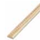
No. D-TM-L58EM 100486 7/32" X 17/32" X 8" 25 PCS/CTN Pine