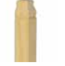
No. D-ICBB-458 100455 1-1/8" X 1-1/8" X 4-1/2" 35 PCS/CTN Pine Fits Moulding up to: 3-1/4"