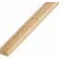
No. D-TM-1067EM 100416 5/16" X 3/4" X 8" 10 PCS/CTN Pine