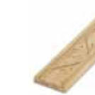
No. D-TM-1090EMRL 105843 3/8" X 1-3/4" X 8" Approx. 50 Ft. Pine