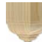
No. D-OCCB-250 100557 3-1/2" X 3-1/2" X 4-1/2" 4 PCS/CTN Pine Fits Moulding up to: 3-1/8"