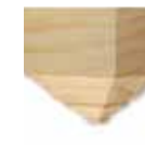
No. D-OCCB-358 105755 7-11/32" X 7-11/32" X 7-1/2" 2 PCS/CTN Pine Fits Moulding up to: 5-1/2"