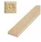
No. D-FLC-225ST 100447 1/2" X 2-1/4" X 7" 4 SETS/CTN Pine