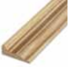
No. D-CR-300EMRL 105760 1-1/16" X 2-15/16" X 8" Approx. 50 Ft. Pine