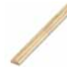
No. D-TM-L58 100485 7/32" X 17/32" X 8" 25 PCS/CTN Pine