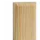
No. D-PB-2751 or D-PB-2751-M 100577 or 105738 7/8" X 2-3/4" X 4-1/2" 18 PCS/CTN and 20 PCS/CTN Pine, UMD Fits Moulding up to: 2-1/2"