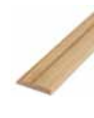
No. D-BB-400EMRL 105742 11/16" X 3-15/16" X 8" Approx. 50 Ft. Pine