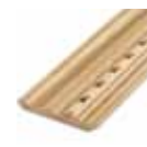
No. D-CM-550DRL 100437 11/16" X 5-1/2" X 8" Approx. 50 Ft. Pine