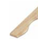
No. D-SM-S2 100606 5/16" X 1-7/8" X 8" 12 PCS/CTN Pine