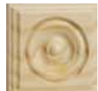
No. D-R-2751BTIN 100587 7/8" X 2-3/4" X 2-3/4" 36 PCS/CTN Pine Fits Moulding up to: 2-1/2"