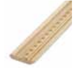
No. D-CM-268DRL 105747 9/16" X 2-3/4" X 8" Approx. 50 Ft. Pine