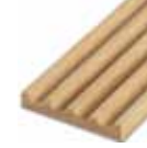
No. D-FLC-400 105762 11/16" X 4" X 7" 10 PCS/CTN Pine