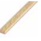
No. D-TM-1073EM 100418 5/16" X 3/4" X 8" 10 PCS/CTN Pine