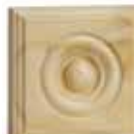
No. D-R-375BTIN 100590 7/8" X 3-3/4" X 3-3/4" 60 PCS/CTN Pine Fits Moulding up to: 3-1/2"