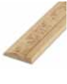
No. D-BB-1054EM 100412 5/8" X 3-1/8" X 8" 6 PCS/CTN Pine