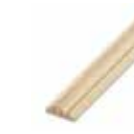
No. D-TM-D7 100441 5/16" X 7/8" X 8" 25 PCS/CTN Pine