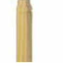
No. D-ICBB-6518 100456 1-1/8" X 1-1/8" X 6-1/2" 35 PCS/CTN Pine Fits Moulding up to: 5-1/4"