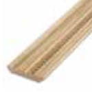
No. D-CM-368RRL 100434 9/16" X 3-5/8" X 8" Approx. 50 Ft. Pine