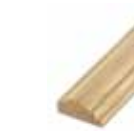
No. D-TM-R42 100596 11/16" X 1-3/4" X 8" 10 PCS/CTN Pine