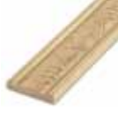
No. D-CR-2010EMRL 105744 5/8" X 3-1/8" X 8" Approx. 50 Ft. Pine