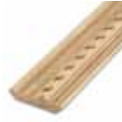
No. D-CM-368DRL 100432 9/16" X 3-5/8" X 8" Approx. 50 Ft. Pine