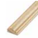
No. D-TM-A9 100422 9/16" X 1-3/16" X 8" 25 PCS/CTN Pine