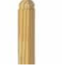
No. D-OCBB-6518 100556 1-1/8" X 1-1/8" X 6-1/2" 24 PCS/CTN Pine Fits Moulding up to: 5-1/4"