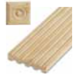
No. D-FLC-7ST 100451 1/2" X 3-1/8" X 7" 4 SETS/CTN Pine