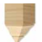
No. D-HCCB-358 105751 3-19/32" X 3-19/32" X 7-1/2" 8 PCS/CTN Pine Fits Moulding up to: 5-1/2"