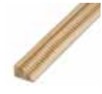
No. D-TM-1064EM 100414 3/4" X 1-1/4" X 8" 10 PCS/CTN Pine