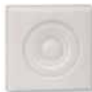
No. D-R-350BTIN 108575 1" X 3-1/2" X 3-1/2" 40 PCS/CTN PPF Fits Moulding up to: 3-1/4"