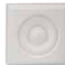
No. D-R-275BTIN 108576 1" X 2-3/4" X 2-3/4" 60 PCS/CTN PPF Fits Moulding up to: 2-1/2"