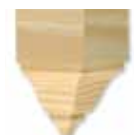
No. D-HCCB-275 105749 2-11/16" X 2-11/16" X 5-11/16" 8 PCS/CTN Pine Fits Moulding up to: 4"