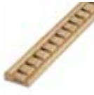
No. D-CR-212DRL 105758 7/8" X 2-1/8" X 8" Approx. 50 Ft. Pine