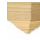
No. D-OCCB-275 105753 5-9/16" X 5-9/16" X 5-11/16" 2 PCS/CTN Pine Fits Moulding up to: 4"