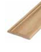
No. D-BB-550EMRRL 105741 11/16" X 4-15/16" X 8" Approx. 50 Ft. Pine