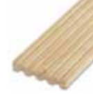
No. D-FLC-7 100448 1/2" X 3-1/8" X 7" 12 PCS/CTN Pine