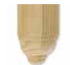
No. D-HCCB-250 100453 1-3/4" X 1-3/4" X 4-1/2" 18 PCS/CTN Pine Fits Moulding up to: 3-1/8"