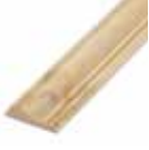
No. D-CR-268EMRRL 105759 3/4" X 2-3/4" X 8" Approx. 50 Ft. Pine