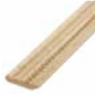
No. D-CM-268R 100429 9/16" X 2-3/4" X 8" 6 PCS/CTN Pine