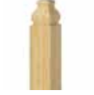
No. D-OCBB-458 100555 1-1/8" X 1-1/8" X 4-1/2" 24 PCS/CTN Pine Fits Moulding up to: 3-1/4"