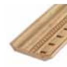
No. D-CM-550EMDRL 105756 11/16" X 5-1/2" X 8" Approx. 50 Ft. Pine