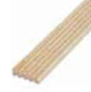
No. D-FLC-225 100446 1/2" X 2-1/4" X 7" 12 PCS/CTN Pine