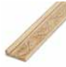
D-CR-21290EMRL 105757 7/8" X 2-1/8" X 8" Approx. 50 Ft. Pine