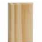
No. D-PB-375 or D-PB-375-M 100580 or 105739 7/8" X 3-3/4" X 6" 10 PCS/CTN Pine, UMD Fits Moulding up to: 3-1/2"