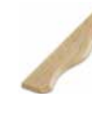
No. D-SM-458EM 100607 5/16" X 2-1/8" X 8" 10 PCS/CTN Pine