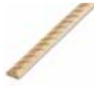
No. D-TM-1065EM 100415 5/16" X 11/16" X 8" 10 PCS/CTN Pine