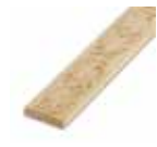
No. D-CR-2054EM 100419 9/16" X 2" X 8" 6 PCS/CTN Pine